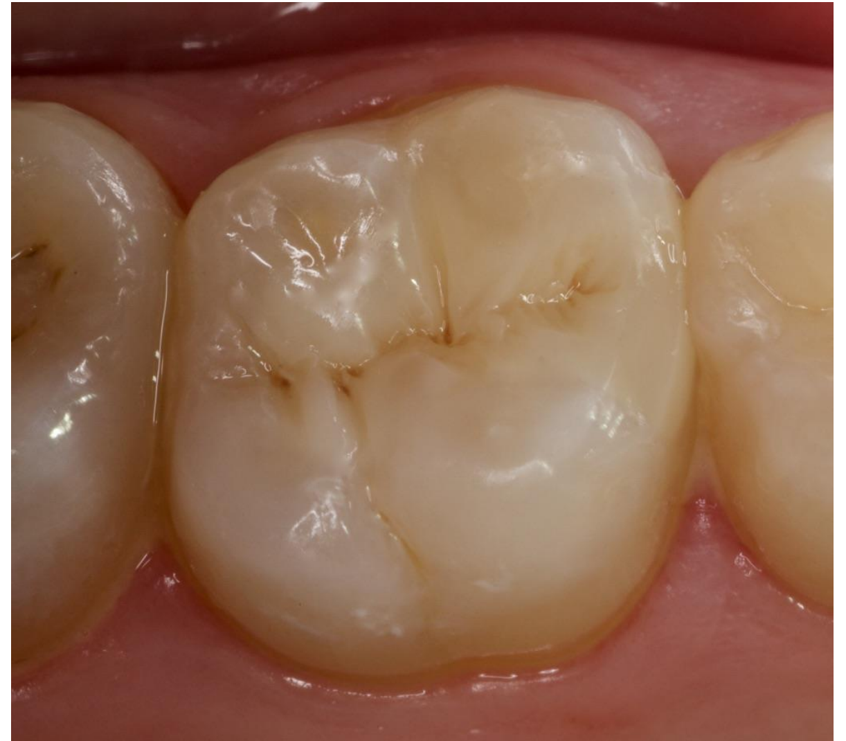
17 month follow up