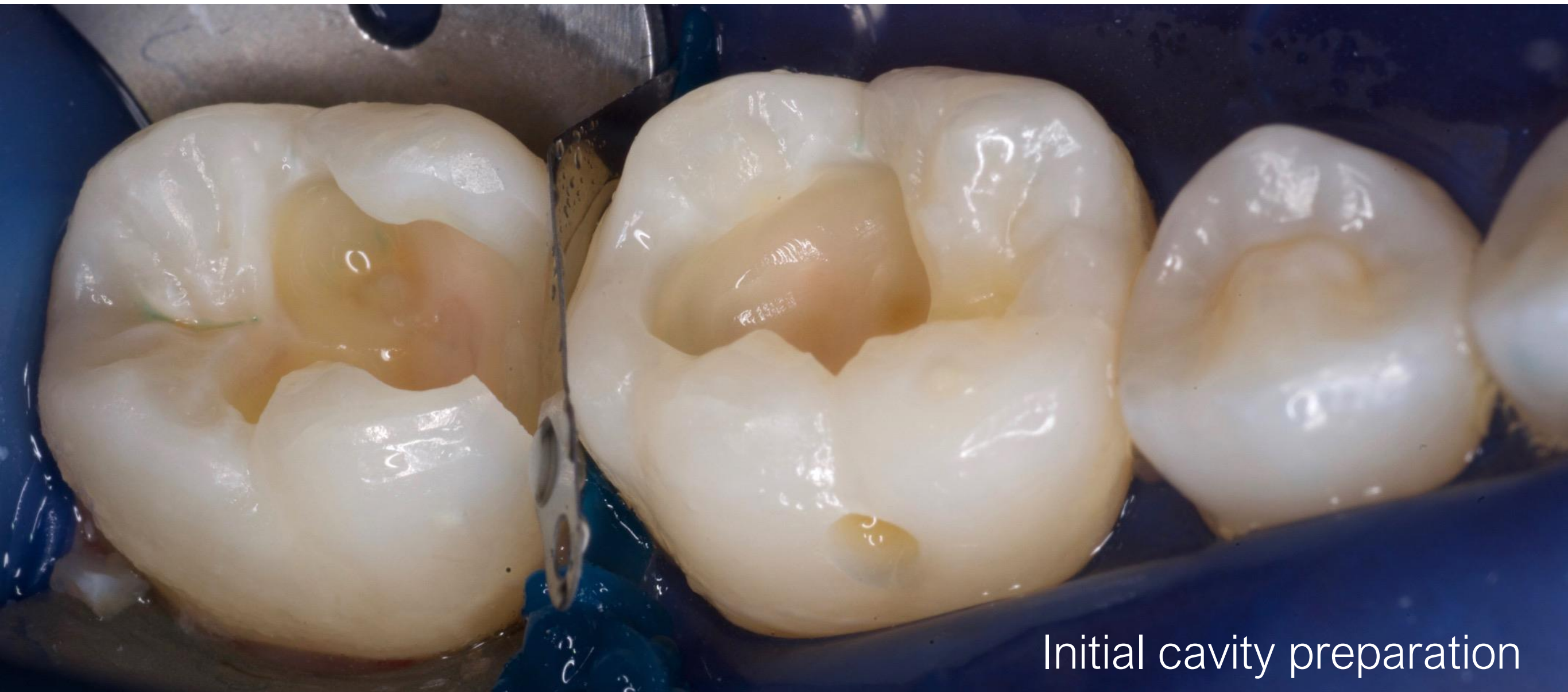
Initial cavity preparation