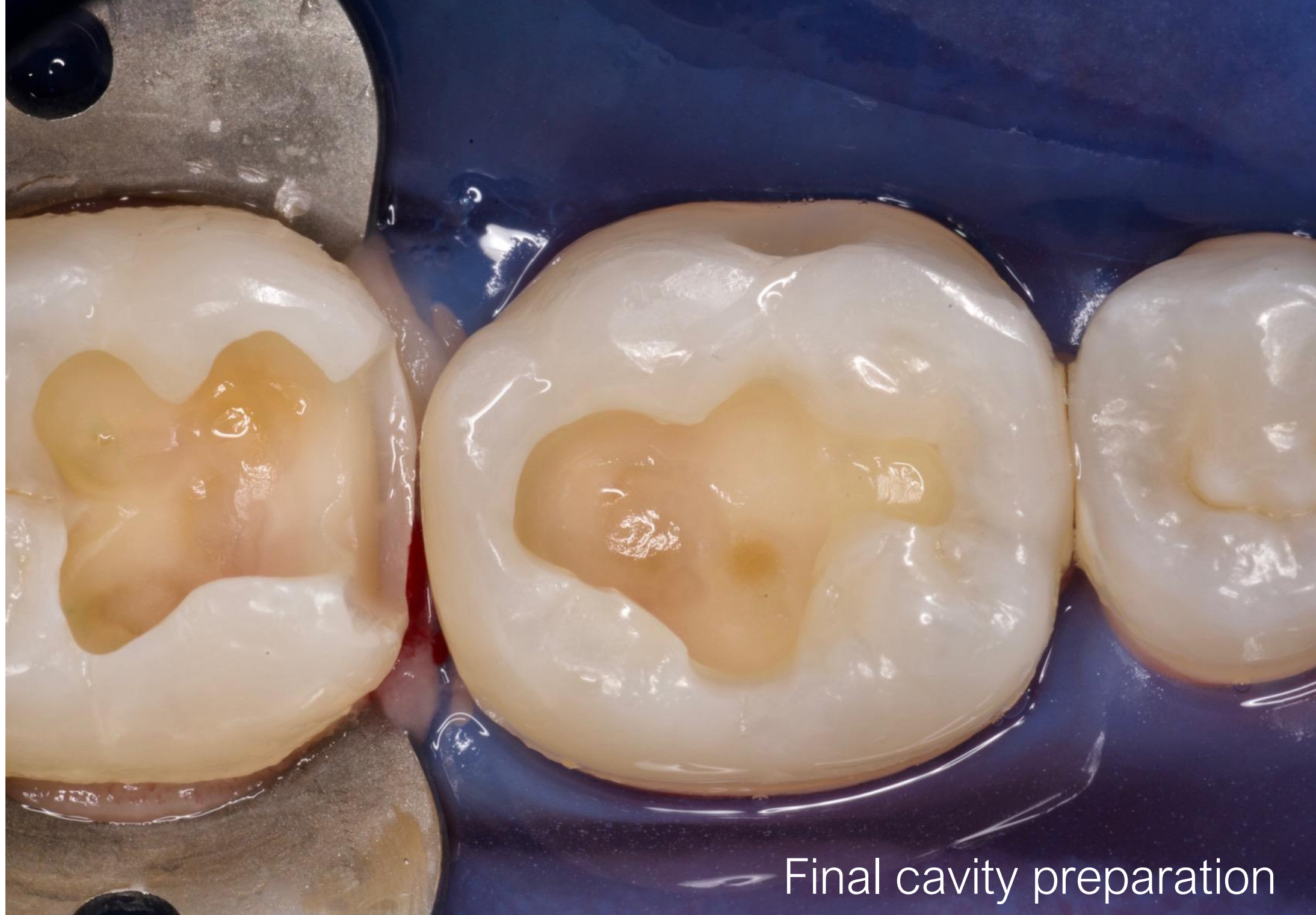
Final cavity preparation